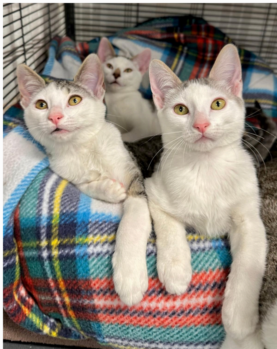
Adventurous Whale (left) and the cuddle crew (right): Hammerhead, Mako, and Tiger ❤️

If you're ready to bring joy, laughter, and a little bit of sunshine into your home, come meet the Shark litter at our Adoption Center this weekend. We're open Wednesdays through Fridays from noon to 5:00 pm, and Saturdays and Sundays from 10:00 am to 5:00 pm.