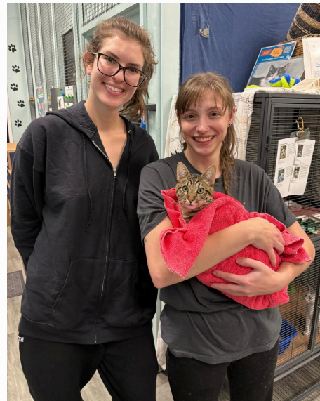
Best Friends volunteers picking up Bobbie to take him to his new home in Utah 🧡

Best Friends Animal Society in Utah answered the call. They had the resources to manage Bobbie's daily care, and we had the experience to help cats with chronic conditions like FIV and FeLV. By coordinating a transfer, we could save even more lives .