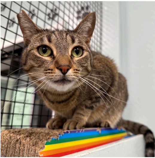
Abbie can't wait to meet you!

From Wednesday, December 17 through Sunday, December 21, all adoption fees are just $50 . It's the perfect time to open your heart to a cat or kitten who has been waiting for a family to call their own.