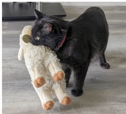
Sienna settling in to her new home

In the months that followed, Sienna blossomed. “She is all we could have dreamed of. She’s warm, playful, friendly, and the least finicky eater I’ve ever seen. She has no problem being picked up, and even purrs while doing so. She also ‘hunts’ for me and leaves her stuffed animal prizes in front of my bedroom door,” they said.