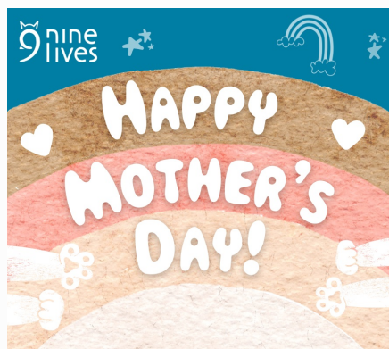
A preview of our Mother's Day eCard

This spring, honor the special people in your life with a gift that gives back. Just in time for Mother’s Day on May 11 and Father’s Day on June 15, we’re offering a new collection of heartfelt eCards — perfect for the cat lovers in your family.